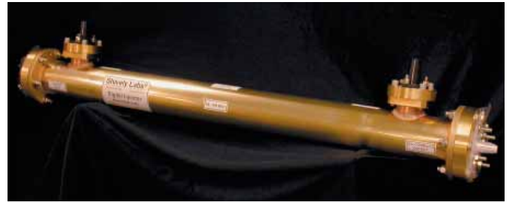
3" injector with optional input adapters